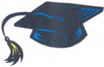
Class of 2017